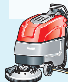
Hakomatic B 45 CL (Wheel drive)