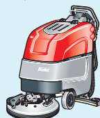
Hakomatic B 45 (Powerflow)

Environmental Management and Audit Scheme D-150-00042